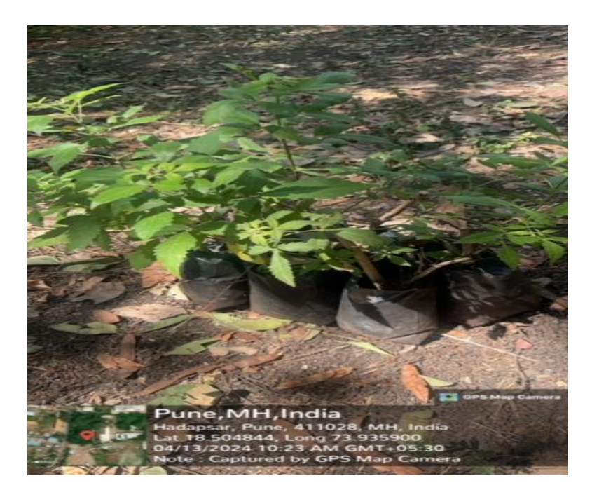
Nirgundi- Vitex negundo