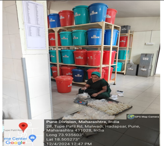
RAW MATERIAL SECTION