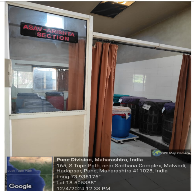
ASAVA- ARISHTA SECTION