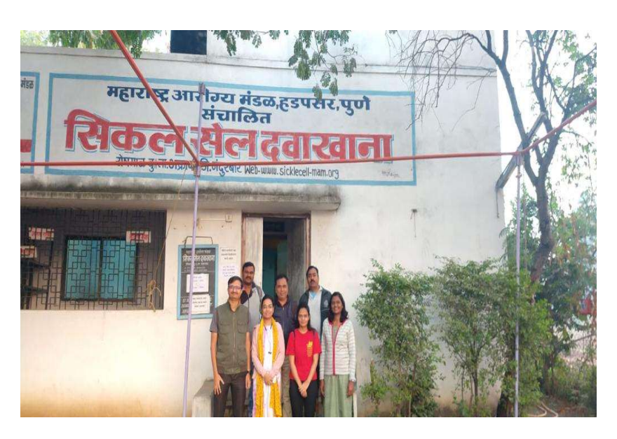
Sickle cell Anaemia clinic