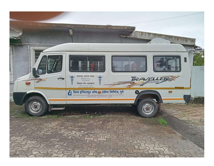
Hospital Ambulance used for sickle cell anaemia camp

Web: www.ssayurved.org, E-mail: ssayu@rediffmail.com, ssayucollege@mam.org.in