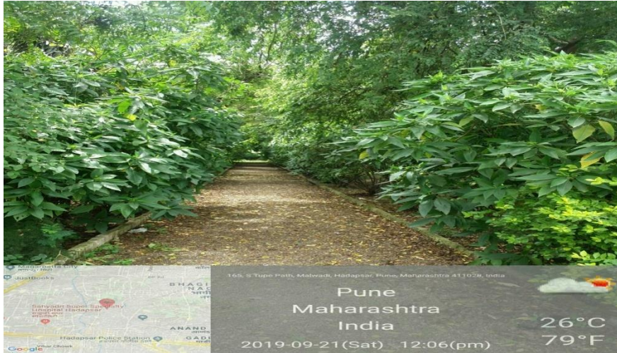
Lush Green ambience