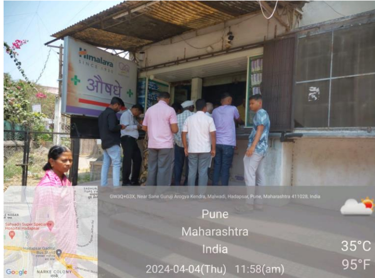
Medical store facility

Web : www.ssayurved.org , E-mail : ssayu@rediffmail.com , ssayucollege@mam.org.in