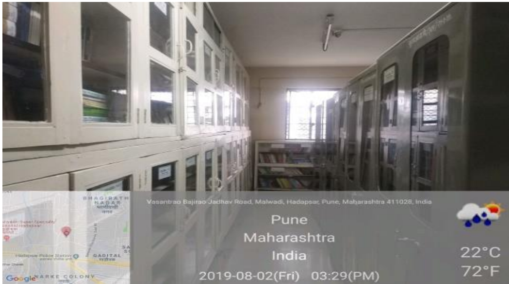
Book Storage 1