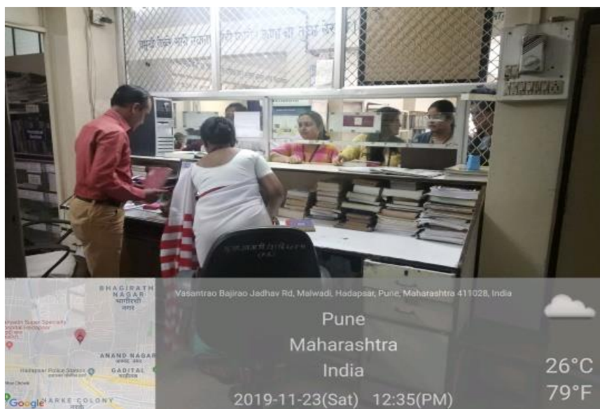
Book issue return counter