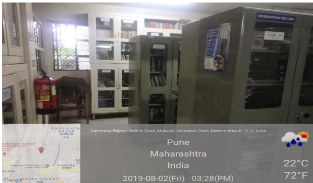
Book Storage 2