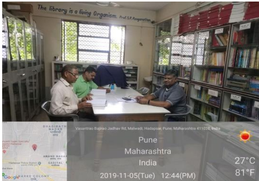
Teacher's Reading Section