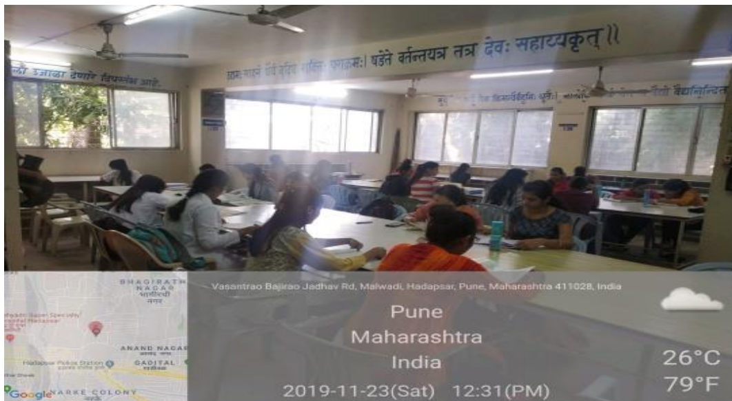
Girl's reading room