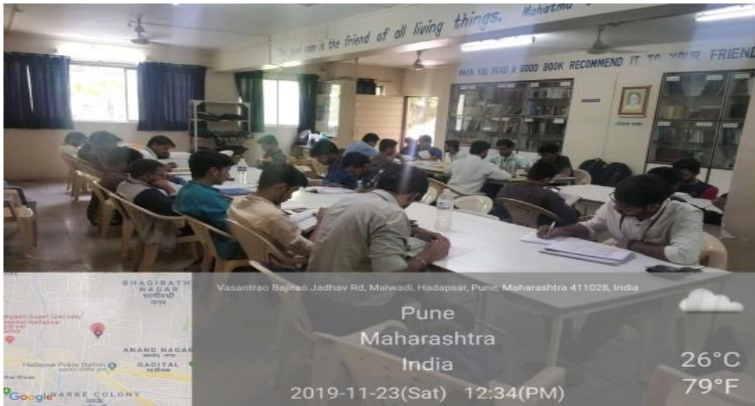
Boy's Reading Room