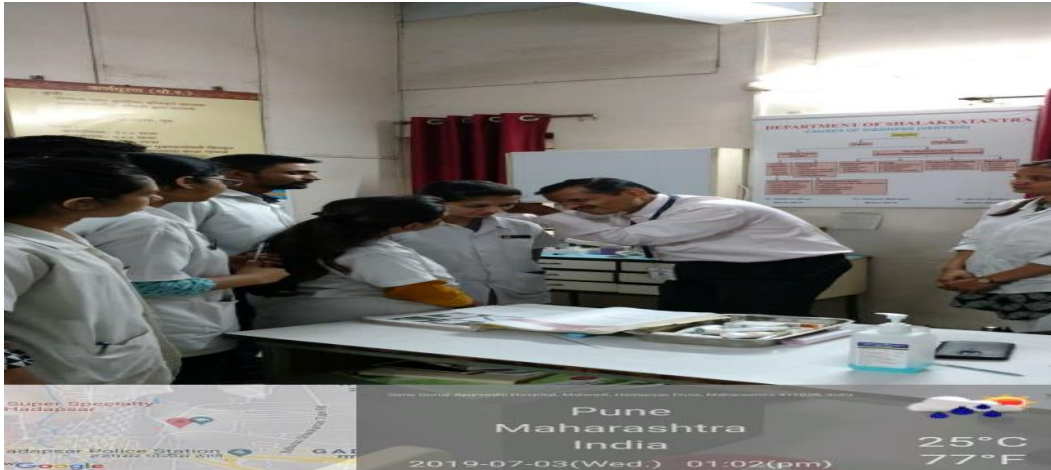
E. N.T. OPD