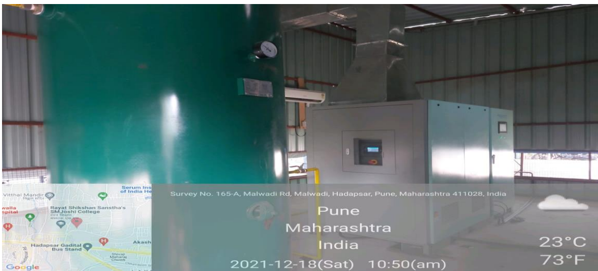
Oxygen Plant 2