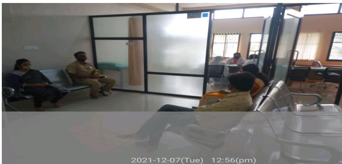
Special OPD 2